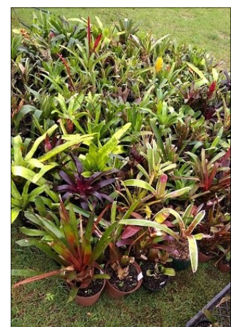
These are the bromeliads that recovered after winter out of about 2000 plus.

All in all, what I realised is that Tillandsia are tough, but far from indestructible, and