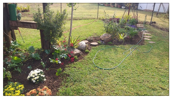
The only part of the garden that is planted up now.

Potted Tillandsia now form the majority of my collection and I plan to keep it that way. I am now experimenting with a lot of the grey, xeric types by trying to grow