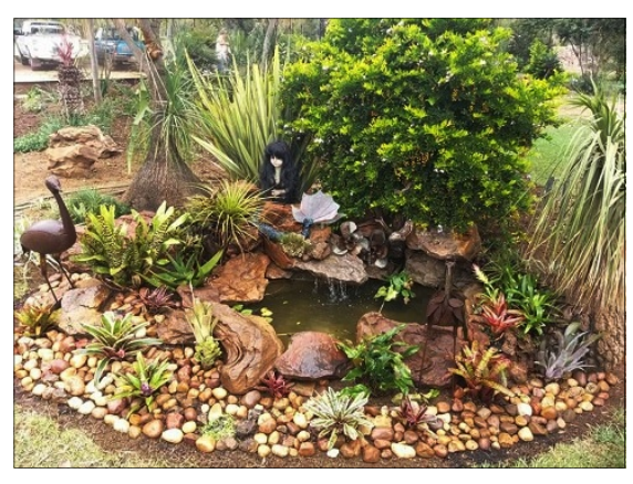
The newly planted gardens created before winter arrived.