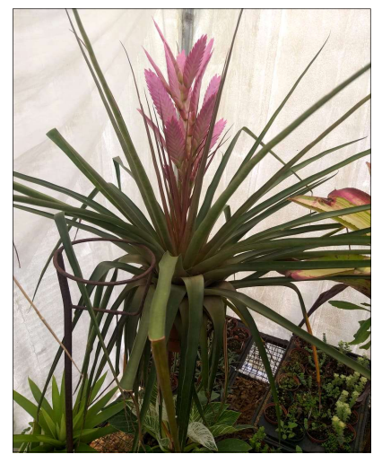
x Walfussia 'Creation' suffered damage in the tunnel.