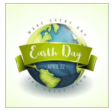
World Earth Day - 22nd April 2021: Worldwide support of the environment and to raise awareness for the environmental protection and care of our amazing planet earth.

Our next meeting will be the show! We are all eagerly looking forward to it and the committee are very busy organizing helpers, tables, various plant related vendors and everything else this mammoth task entails. You will be able to get a bite to eat when there as well. This is not a judged show, just a planned fabulous display of bromeliads and Tillandsia to knock the East London communities socks off!!!!! So please could you look through your garden and find some specimens that are looking great, spruce them up and bring them along on Friday 23rd April to the Little Beacons Pre-Primary School hall, we will be there all day setting up. Time to show off!!!!