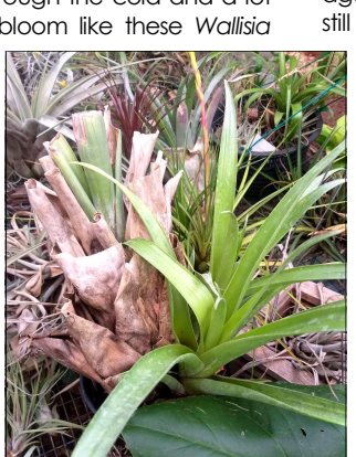
Tillandsia ampla died but has since produced two pups.