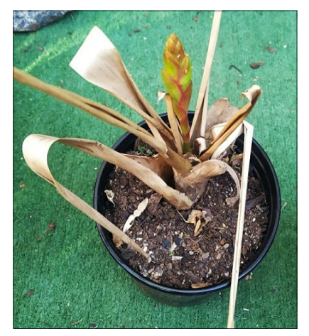
A resilient Vriesea. This plant looked dead but still had the energy to produce an inflorescence and pups.

By the second week of minus temps I had lost nearly 60% of my epiphytic in the tunnel.