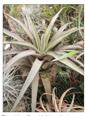
Tillandsia tillandsioides that was away from the plastic in the tunnel.