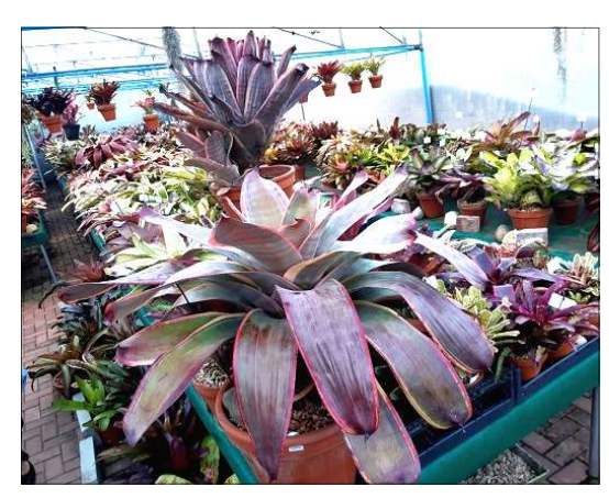
My personal favourite Neoregelia 'The Hulk'