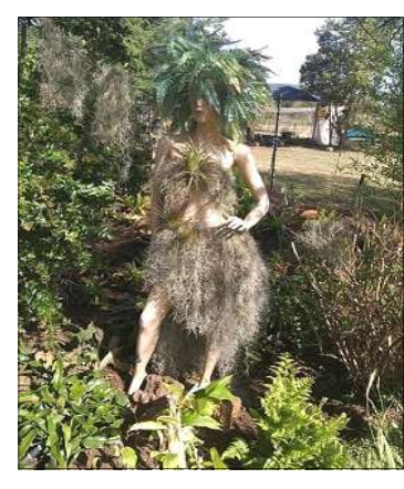
In the meantime the 'garden ladies' were donated to a friend. I have abandoned the garden and we moved over to a smaller place on the same farm.