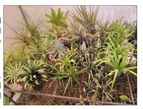
The few potted plants that needed to recover are all looking good now.