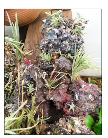
The diaphoranthema types of Tillandsia that are grown on lava rock all made it through.