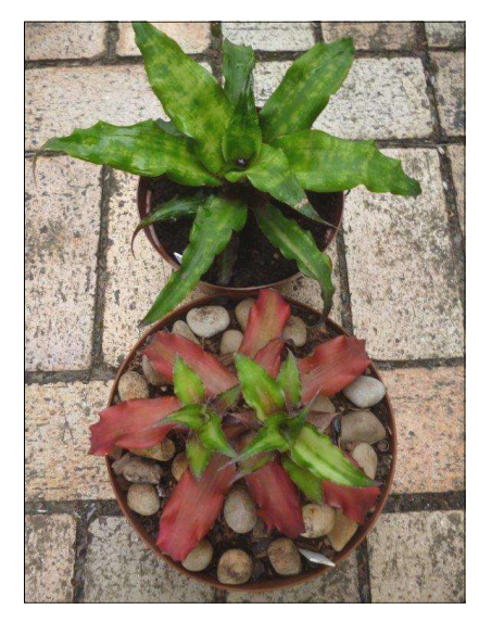
Cryptanthus 'Moon River'

It is amazing how the light you grow your plant in affects the foliage colour. You can have the same plant positioned in various areas in your garden, some shady some sunny etc. and they will all look like different plants! Text and photo L. Wegner