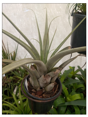
Tillandsia tillandsioides that was against the plastic of the tunnel is still recovering