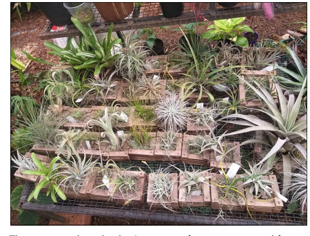
The new baskets I am using are working

the other half in a wire basket. The one in the basket was completely dead within a week. I then realised that all the potted Tillandsia that got damaged were the ones on the wire shelves, and the good looking ones were the ones on the wooden shelves!!!