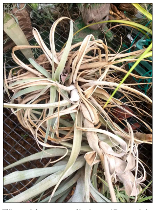
Tillandsia capitata 'Peach' has now produced a pup.